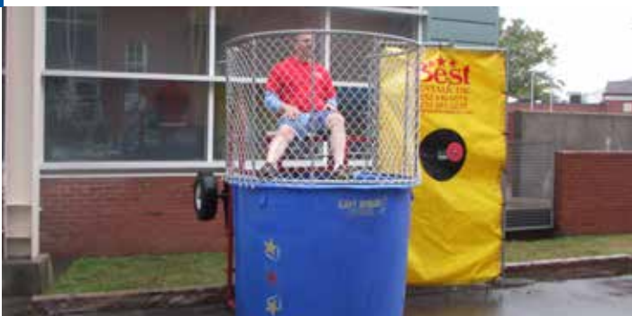
City of Rocky Mount Dunking booth helps increase campaign efforts.