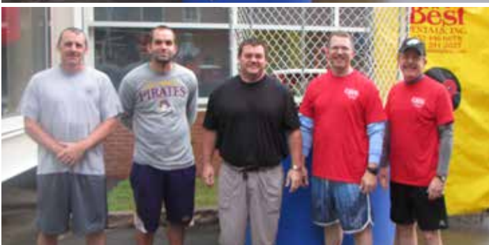
Nash UNC Health Care incorporates raffle, plate sales and employees' favorite sports teams to raise awareness and support for United Way.