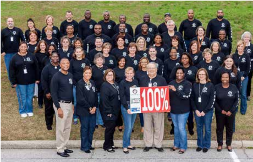
Nash-Rocky Mount Public Schools Central office attains 100% participation for the United Way campaign.

($30 - $49 per capita) Boice-Willis Clinic Down East Partnership for Children Nash County Government Nash-Rocky Mount Schools Rocky Mount Family YMCA, Inc. Southern Bank & Trust Company Suddenlink Communications Target Store Telco Credit Union Tyson Foods V.O.I.C.E.