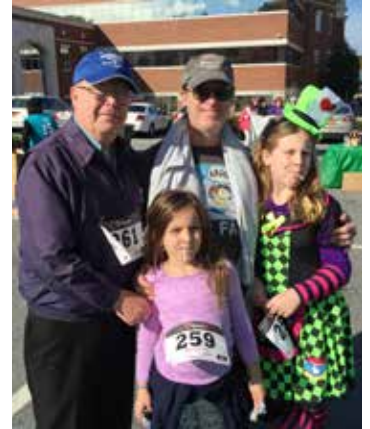
Nash County Government sponsors 3rd Annual Monster Dash 5k Race and 1 mile Fun Run. Over 250 runners participated in the race.