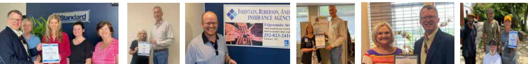
(l to r) Standard Insurance Co, ALDH, Fountain, Roberson, & Anderson Insurance Agency, VOICE, Southern Bank, Tarboro Community Outreach