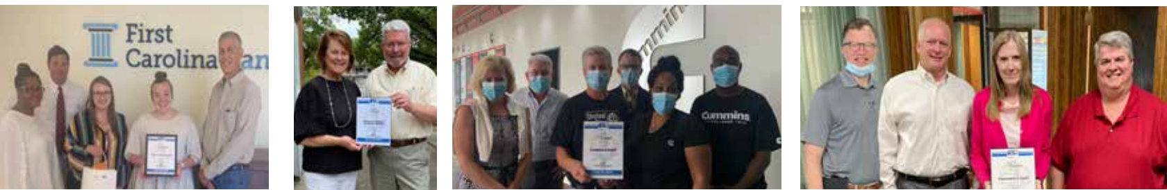
(l to r) First Carolina Bank, Meals on Wheels of Rocky Mount, Cummins-Rocky Mount Engine Plant, Providence Bank