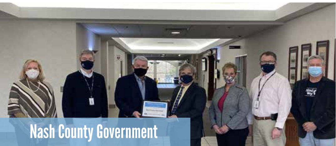
Nash County Government