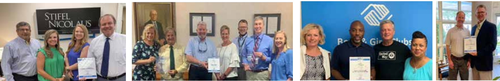
(l to r) Stifel, Nash County Government, Boys & Girls Clubs of the Tar River Region, Bunch & Co, LLP