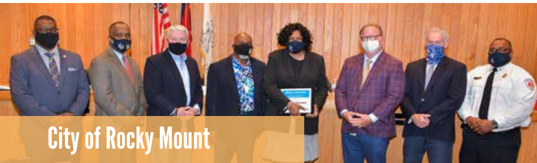
City of Rocky Mount