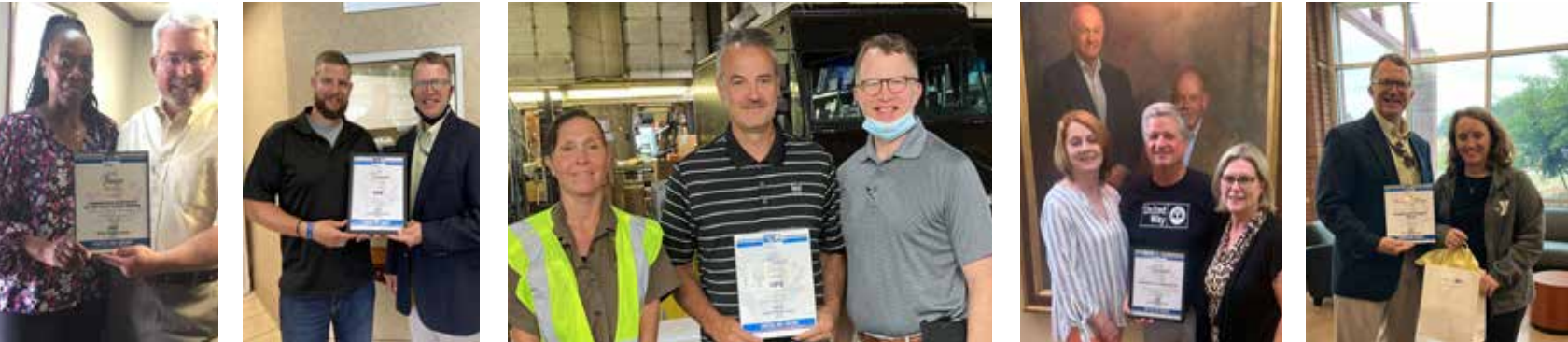
(l to r) Communities In Schools of the Rocky Mount Region, RSM, UPS, Boddie-Noell Enterprises, Rocky Mount Family YMCA

These awards are based on at least $30 per employee giving and 25% participation during the 2020 campaign season. Each recipient received an award and an on-site visit from United Way representatives during our Appreciation Patrol. It is our chance to give an extra “thank you” for their continued support of United Way and our community.