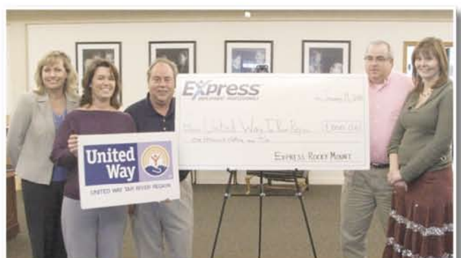
Express Personnel contributes an additional $1,000 through their "Pay It Forward" campaign; with a total Contribution of $9,400