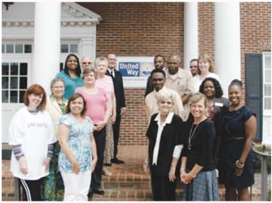
Campaign Advocates and Partner Representatives convene to discuss best practices for informing the community about the good works of United Way