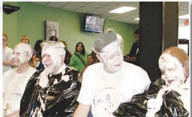
Nash Community College "Pie in the Face" contest generates excitement among staff and students.